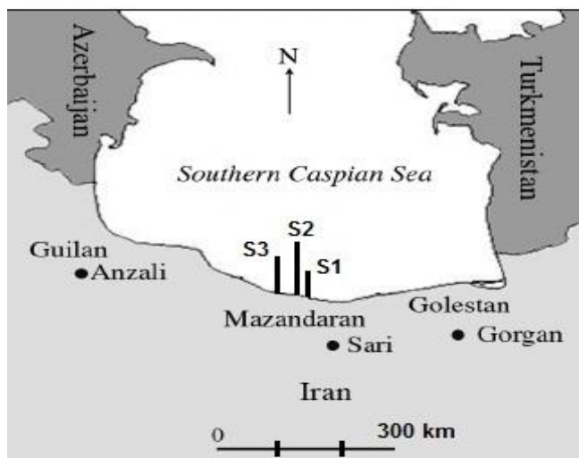
Fig. 1. Sampling area of the central southern coast of Caspian Sea in 2015-2016: S1(Babolsar; 36°42' N, 52°39' E), S2 (Fereydunkenar; 36°40' N, 52°31' E) and S3 (Mahmudabad, 36°37' N, 52°15' E)